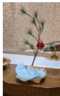
Christmas in July July 28